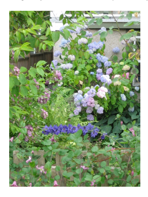
Matthew 5:8 "Blessed are the pure in heart: for they shall see God."

Scripture from 400<sup>th</sup> anniversary edition of The Holy Bible, original King James 1611 version.